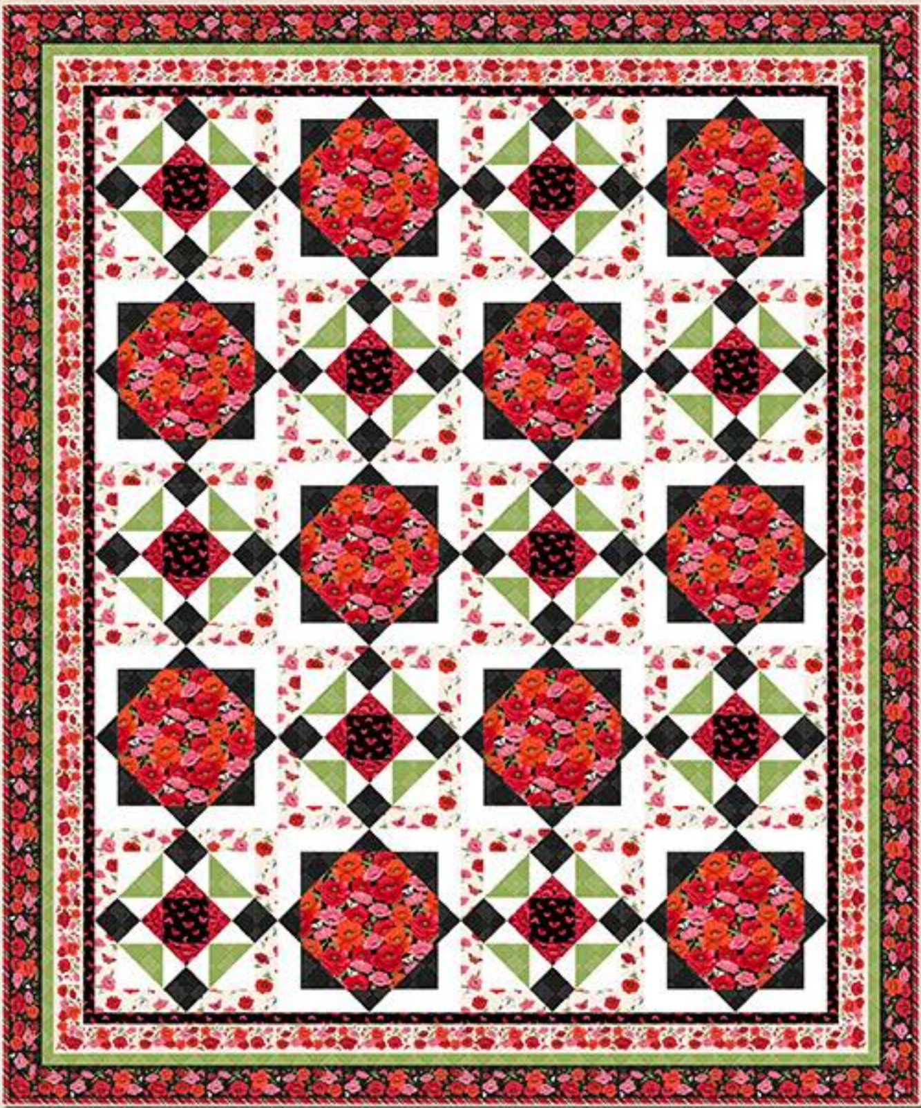
Finished Size: 79" x 95" ( 2.01m x 2.41m) Technique: Pieced Pattern available at www.needleinahayesstack.biz