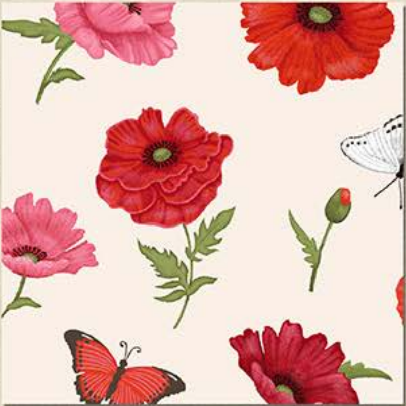
Tossed Poppies and Butterflies 7768-48 44" Backing Fabric Option