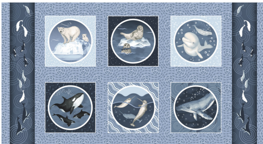
7896-17 Polar Plungers Block Print Blue