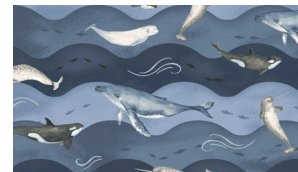
7894-77 Whales and Waves Navy