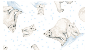
7891-01 Polar Bears White