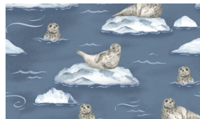
7892-77 Seals Denim