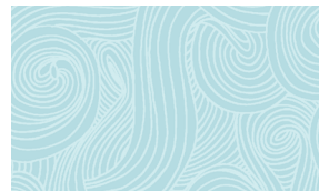
1351-Seaglass Just Color!