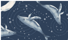
7884-77 Humpbacks and Belugas Navy