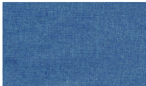
Blue Jay-41 Peppered Cottons