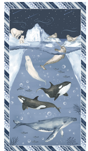
7897P-17 Panel Blue