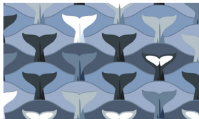
7888-17 Whale of a Tail Blue