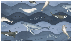
7894-77 Whales and Waves Navy