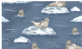
7892-77 Seals Denim