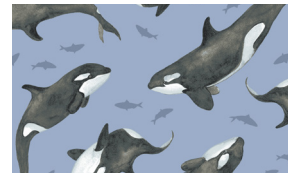
7893-17 Orcas Blue