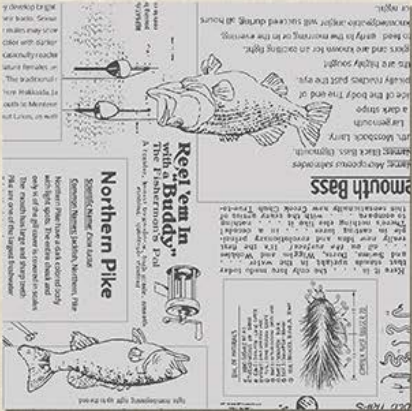
Newsprint 7960-09 44" Backing Fabric Option