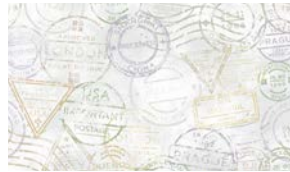
8501-19 Postage Toss Mist