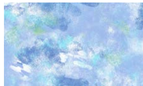
8505-75 Allover Texture Lapis