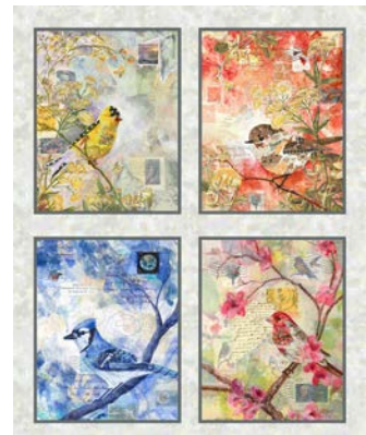
8506-19 Four 15" x 19" Blocks Mist