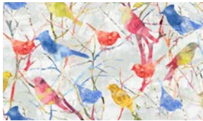
8497-19 Bird Silhouette Allover Mist

All fabric quantities are based on 15yd bolts unless otherwise indicated.