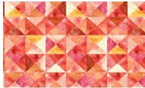
8502-83 Abstract Geo Red