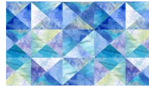
8503-76* Abstract Geo Pacific