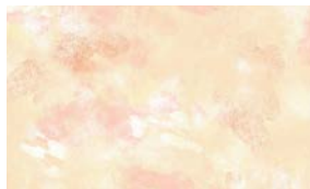
8505-34 Allover Texture Peach