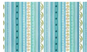
8538-78 Teeny Stripe Mint