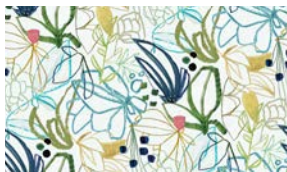
8536-64 Abstract Outline Flowers Matcha