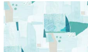
8534-69 Minimalist Collage Jade