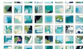
8539-69 Gallery Wall Jade