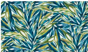
8530-71 Leaf Allover Turquoise

All fabric quantities are based on 15yd bolts unless otherwise indicated.