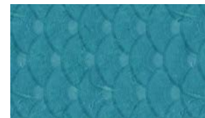
8540-69* Rainbow Texture Jade