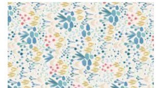
8535-14 Rock Garden Cream