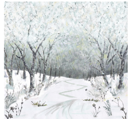
8443P-79 Winter Road Slate