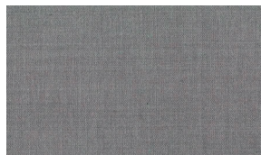
Granite-10 Peppered Cottons Granite