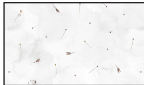
8441-11 Dry Ditsy Pearl