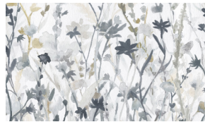
8436-11 Winter Floral Pearl