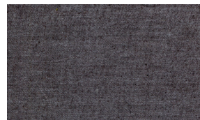
Charcoal-14 Peppered Cottons Charcoal