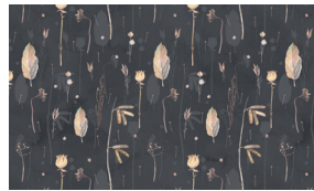
8438-74* Dry Leaves Midnight