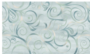
8440-17 Windy Swirl Ice