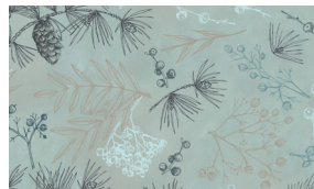
8442-78 Tree Bits Mint