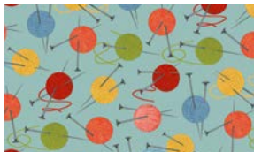
8476-17 Yarn Balls Medium Blue