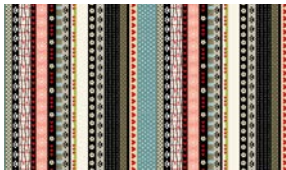
8480-91* Stripe Multi