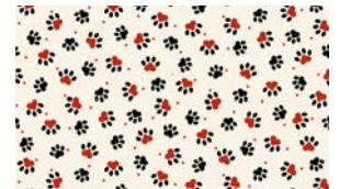
8479-33 Paw Prints Ecru