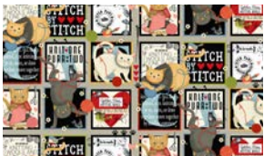
8475-99 Patch Black

All fabric quantities are based on 15yd bolts unless otherwise indicated.