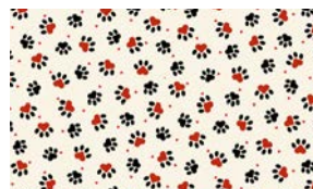
8479-33 Paw Prints Ecu