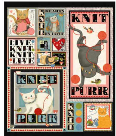
8484P-99 36 Inch Panel Black