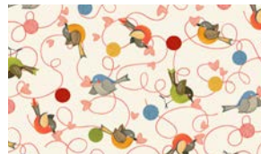
8477-33 Birds Ecu