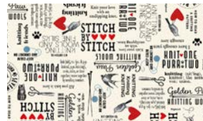
8478-33 Newsprint Ecu