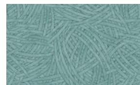
8482-17* Yarn Texture Medium Blue