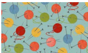
8476-17 Yarn Balls Medium Blue

All fabric quantities are based on 15yd bolts unless otherwise indicated.