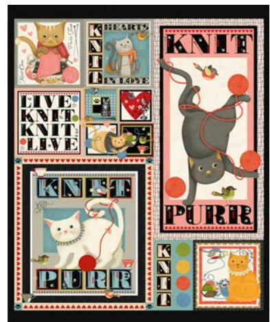
8484P-99 36 Inch Panel Black