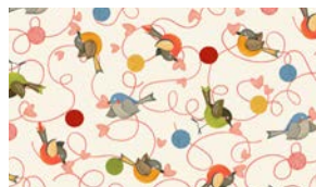
8477-33 Birds Ecru