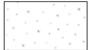
8523-03 Tossed Stars White/Multi