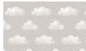
8522-90 Raindrops Gray/White