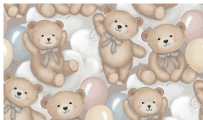
8519-34 Teddy Bears and Clouds Gray/Multi

All fabric quantities are based on 15yd bolts unless otherwise indicated.