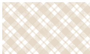
8524-30 Diagonal Plaid Oatmeal/White