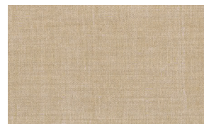
Flax-7* Peppered Cottons Flax

Our use of the Border Stripe for the Optional Border requires more fabric than stated in the pattern.