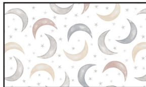
8521-03 Moon and Stars White/Multi