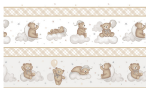
8525-34 Border Stripe Oatmeal/Gray