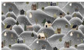
8464-93 Snowville Storm