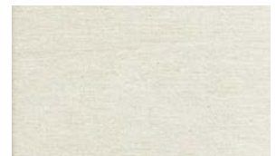
Oyster-35 Peppered Cottons Oyster