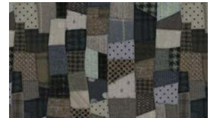
8463-79 Blanket Stitch Patchwork Slate