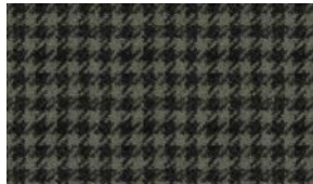
8461-60 Houndstooth Green/Black