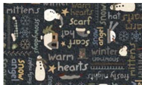
8466-97 Snow Many Words Graphite