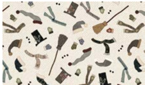
8460-14 Snowman Accessories Cream

All fabric quantities are based on 15yd bolts unless otherwise indicated.