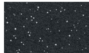
8467-97* It's Snowing Graphite