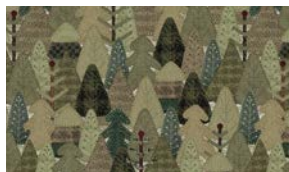
8465-62 Woolen Forest Moss