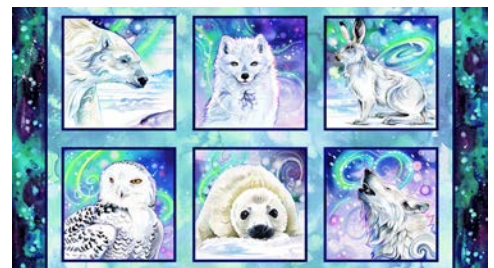
8515-52 24 Inch Blocks Amethyst