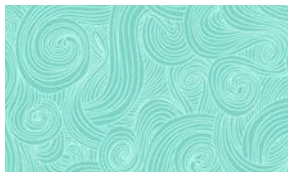
1351-Light Teal Just Color! Light Teal