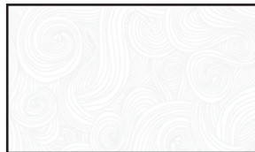
1351-Pigment White Just Color! Pigment White