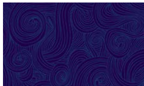
1351-Navy* Just Color! Navy