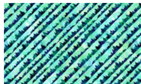
8511-78 Diagonal Trees Mint Blue