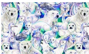
8509-52 Tundra Animals Amethyst

All fabric quantities are based on 15yd bolts unless otherwise indicated.