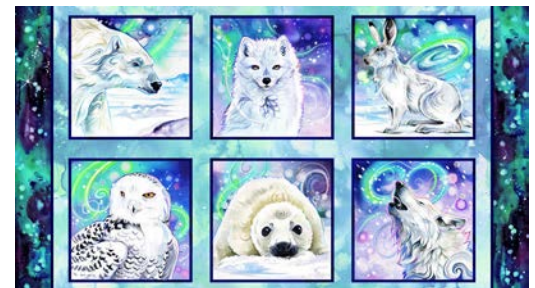
8515-52 24 Inch Blocks Amethyst