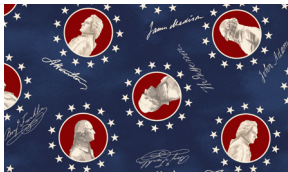
8572-77 Founding Fathers Navy

All fabric quantities are based on 15yd bolts unless otherwise indicated.