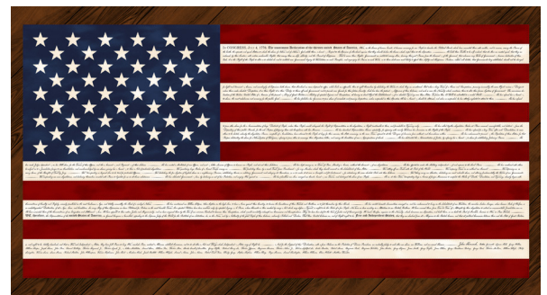
8583P-87 Flag Panel Red/Navy