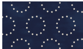
8576-77* 13 Stars Navy