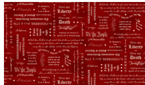
8573-88 Quotes Red