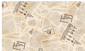
8575-44 Papers Texture Cream