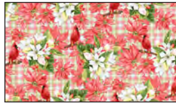
7808-28 Cardinals and Florals - Pink