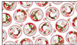
7811-08 Mini Santa Circles White/Red