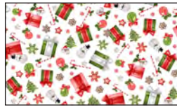
7806-08 Gifts White/Red