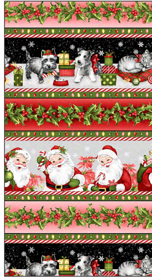
7814-89 Stripe Red/Black