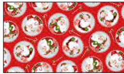
7805-88 Santa Circles Red