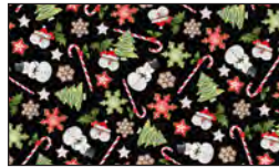
7809-99 Holiday Treats Black