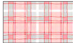
7813-22 Plaid Pink

Selected fabrics from the Peppered Cottons collection