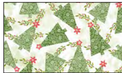
7812-06 Christmas Trees - White/Green