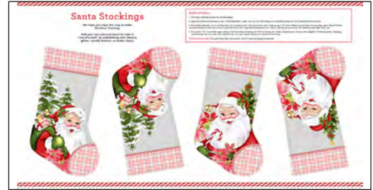
7816P-29 Santa Stocking Panel Pink/Gray