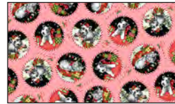
7810-22 Cats and Dogs Pink