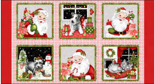
7815-28 Block Print Pink/Red