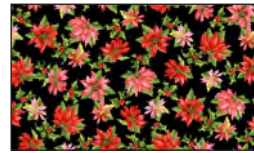
7807-99 Poinsettias Black