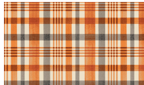
7665-39 Plaid Rust