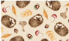
7658-33 Hedeghogs Cream