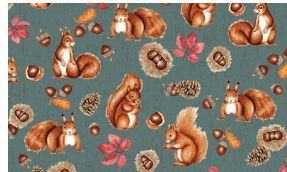
7661-77 Squirrels Teal