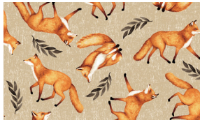
7660-33 Foxes Beige