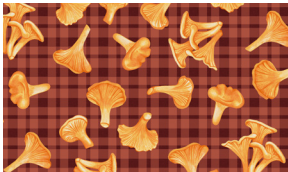
7657-33 Chanterelles Rust