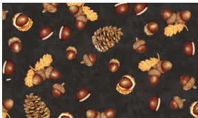
7664-93 Acorns and Cones Charcoal