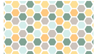
7825-46 Mini Hex Yellow-Green