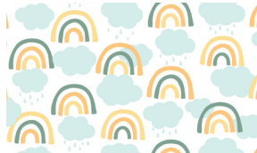
7822-14 Rainbows Blue-Yellow