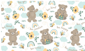
7820-149 Bears Blue-Taupe