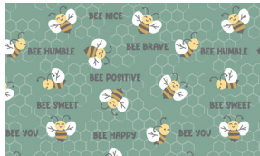
7821-66 Bee Sayings Green