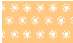
7829-44 Suns Yellow