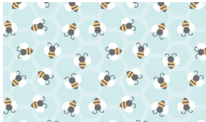
7826-11 Bee Hex Lt. Blue