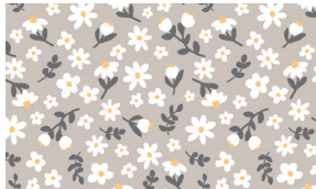
7827-39 Daisies Taupe