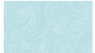
1351-Seaglass Just Color!