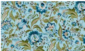
8401-17 Jacobean Floral Lt. Blue

All fabric quantities are based on 15yd bolts unless otherwise indicated.