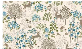
8403-40 Deer Scenic Pale Ecru