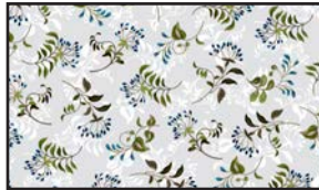
8406-90 Flowering Vine Toss Silver Gray