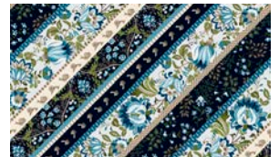
8404-77* Diagonal Stripe Midnight Blue