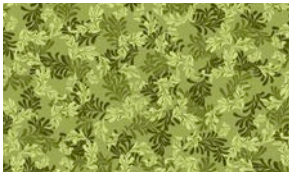
8405-66 Acanthus Leaf Peridot Green