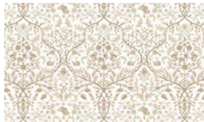
8402-04 Ogee White