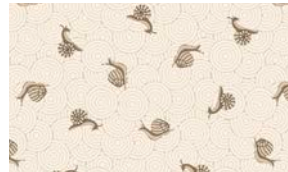
8407-40 Snail Pale Ecru