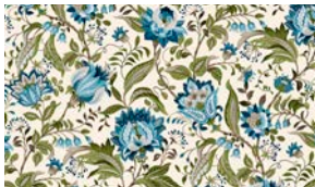
8401-40 Jacobean Floral Pale Ecru