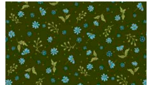
8409-67 Ditsy Dk. Green