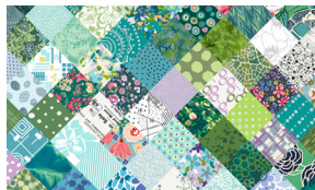
8421-67 Cheater Patch Teal Green

All fabric quantities are based on 15yd bolts unless otherwise indicated.