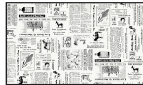
8424-01 Newspaper Ads Off-White

Note: Yardage requirements depend on the size being made. Above based on Size 14 jacket.