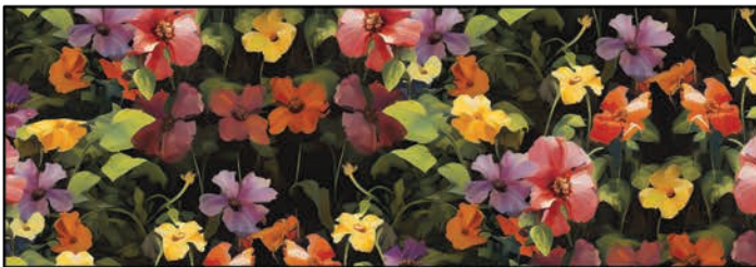
Morning Glory 22972-BLK-CTN-D