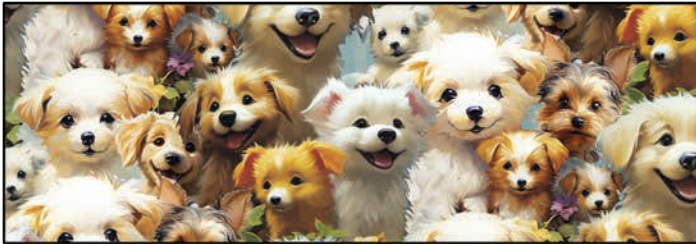
Playful Pups 22970-MLT-CTN-D