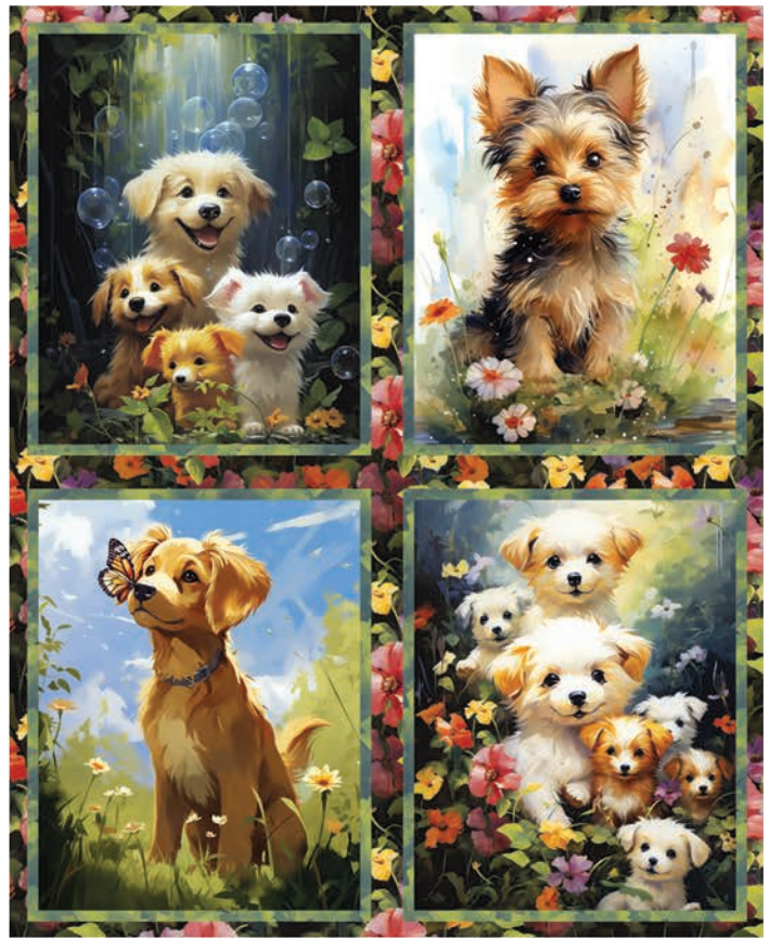
Fur-Ever Friends 36in Panel 22974-PNL-CTN-D