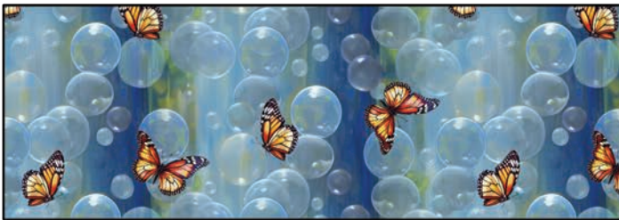
Butterflies and Bubbles 22971-BLU-CTN-D