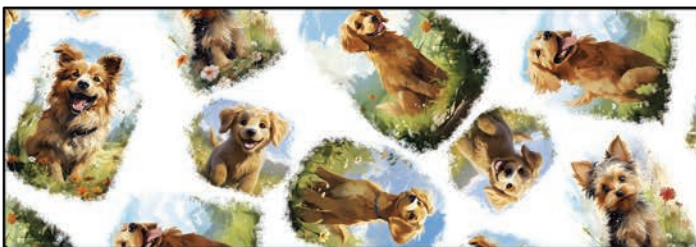
Doggone Cute 22973-WHT-CTN-D