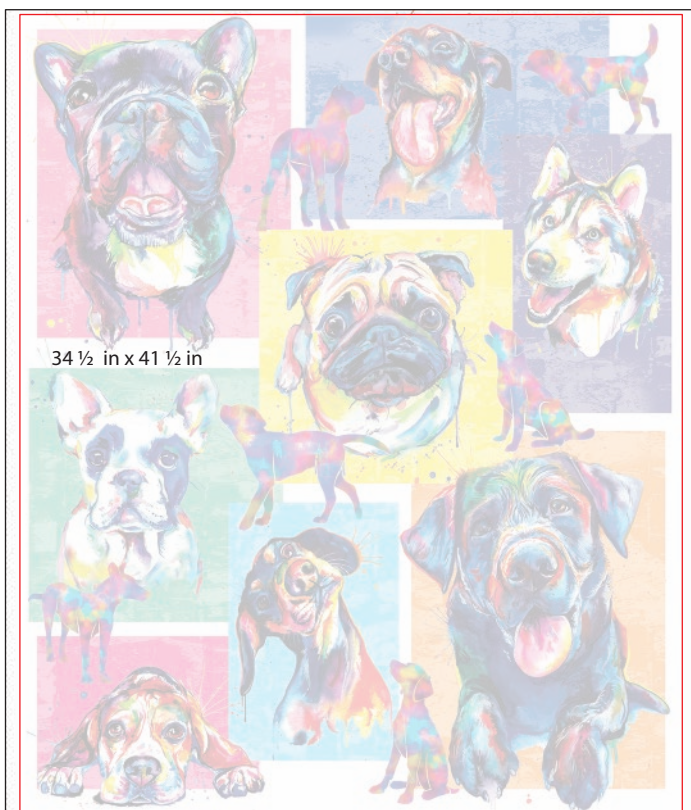
34 ½ in x 41 ½ in

Use a rotary cutter and ruler to cut the size and number of rectangles from each fabric listed below.