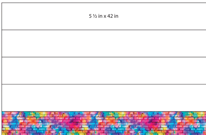
5 ½ in x 42 in