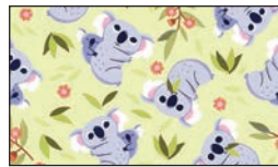
8085-60 Koalas Green