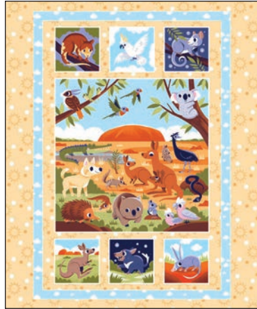
8096P-44 Aussie Oz-Born Panel Yellow