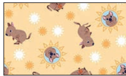
8091-44 Quokkas Yellow