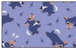
8088-70 Tasmanian Devils Periwinkle