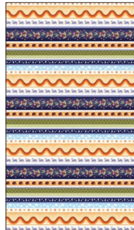
8089-37 Mini Stripe Orange/Blue