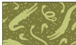
8094-66 Reptiles Green

Selected fabric from the Peppered Cottons collection