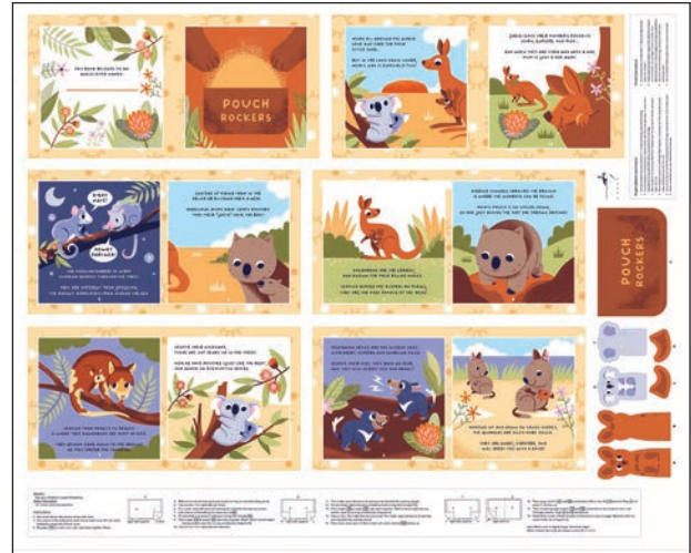
8097P-44 Pouch Rockers Book Panel Yellow