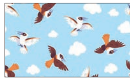
8086-11 Kookaburras Lt. Blue