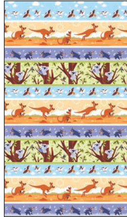
8095-36 Aussie Stripe Orange/Green