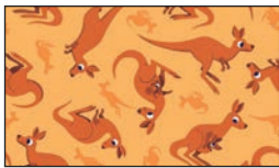
8084-33 Kangaroos Orange