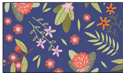
8093-77 Eucalyptus and Waratahs - Dark Blue