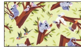
8092-60 Canopy Critters - Lt. Green