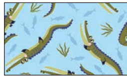
8090-11 Crocs Lt. Blue