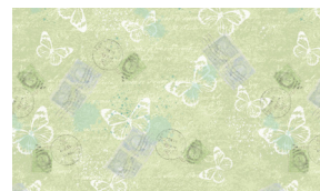
8044-61 Tossed Postage and Butterflies Lt Green