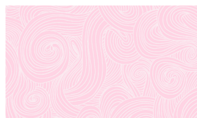
1351-Powder Pink Just Color! Powder Pink