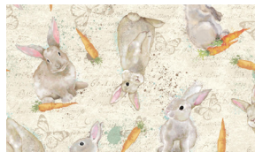
8039-13 Tossed Bunnies and Carrots Orange