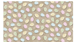
8041-39 Tossed Eggs Oat