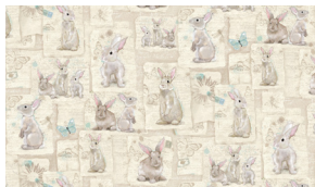
8037-14 Patch Work Collage Cream