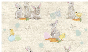
8038-14 Allover Bunnies with Chicks Cream