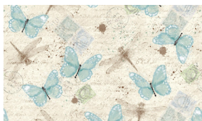
8043-41 Tossed Butterflies and Dragonflies Lt Blue