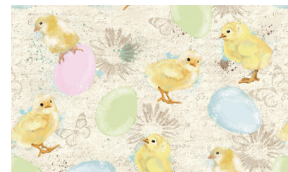
8040-40 Tossed Chicks and Eggs Yellow