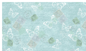
8044-11 Tossed Postage and Butterflies Lt Blue