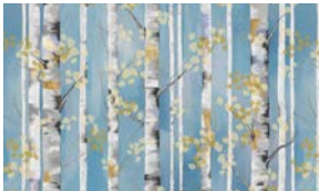
8649-79 Birch Trees Slate

All fabric quantities are based on 15yd bolts unless otherwise indicated.