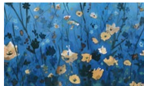
8657-73 Reaching Floral Peacock