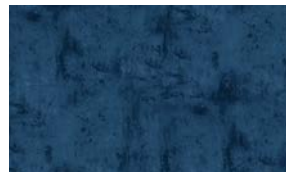
8278-77* Surface Design Navy