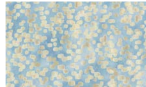
8652-79 Golden Dots Slate