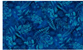
8603-77 Forest Ferns Indigo