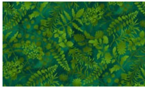
8603-66 Forest Ferns Forest Green