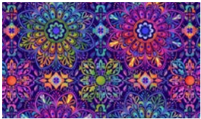
8602-77 Medallions Indigo

All fabric quantities are based on 15yd bolts unless otherwise indicated.