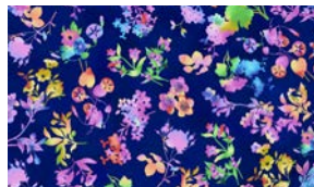
8604-77 Floral Silhouette Indigo