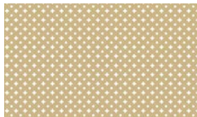
8708-34* Geo Parchment