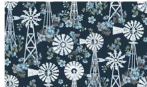
8705-79 Wind Power Deep Indigo