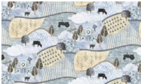
8702-19 Countryside Steel Blue

All fabric quantities are based on 15yd bolts unless otherwise indicated.