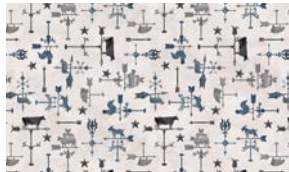
8703-33 Weather Vane Ecru