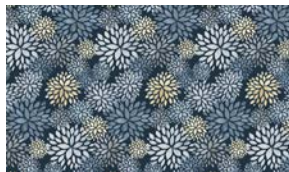
8707-79 Multi Mums Deep Indigo