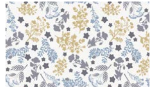
8706-31 Wildflower Ecru/Steel