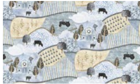
8702-19 Countryside Steel Blue