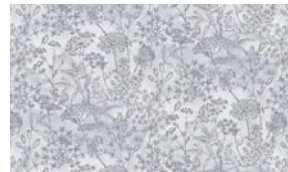
8710-90 Spring Garden Sketch Pewter