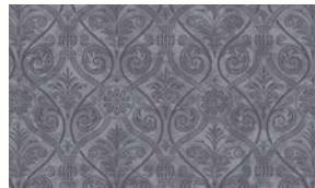
8709-99 Damask Charcoal