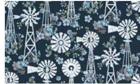
8705-79 Wind Power Deep Indigo