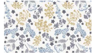
8706-31 Wildflower Ecu/Steel