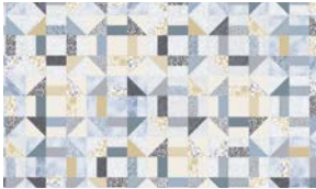
8701-19 Churndash Cheater Quilt Steel Blue

All fabric quantities are based on 15yd bolts unless otherwise indicated.