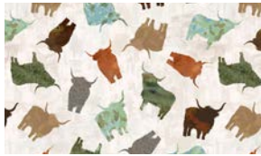
8618-63 Cow Silhouette Toss Multi