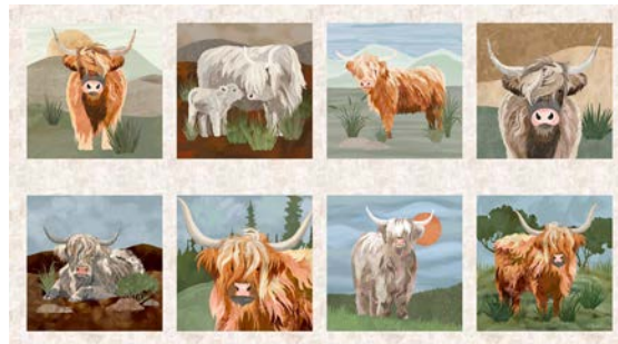
8627B-11 Eight Blocks Panel 8627B-11