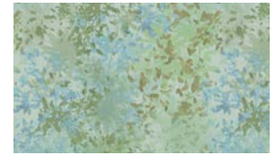
8624-64 Leaves Texture 8624-64