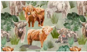
8616-61 Cows and Trees Sage

All fabric quantities are based on 15yd bolts unless otherwise indicated.