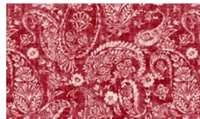
8594-82 Paisley Ruby