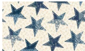
8593-17 Big Stars on Cream Cream