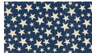
8596-73 Small Stars Blue