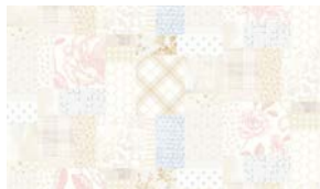
8591-14 Patch Work Cream

All fabric quantities are based on 15yd bolts unless otherwise indicated.