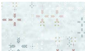
8733-17 Teeny 9-patch Plus Ice