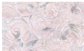
8734-12 Scroll Moulding Champagne