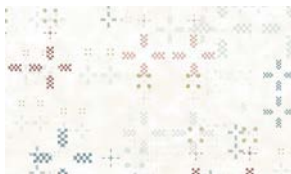
8733-14 Teeny 9-patch Plus Cream

All fabric quantities are based on 15yd bolts unless otherwise indicated.