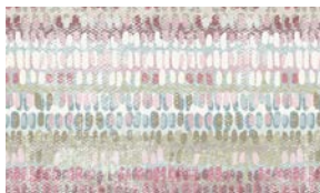
8738-00* Seeing Spots Misc. Muted