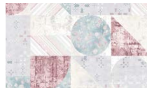
8735-91 Reclaimed Patchwork Silver