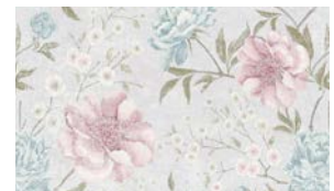
8736-11 Found Floral Pearl