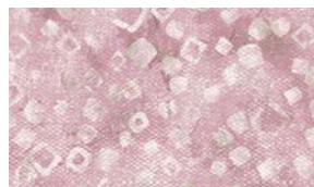
8741-26 Falling Squares Rose