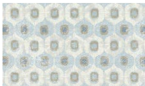
8737-17 Organic Wavy Retro Ice