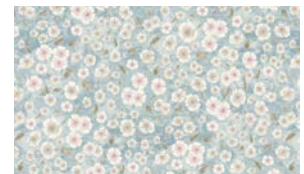
8740-79 White Cosmos Slate