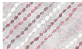
8742-19 Beaded Curtain Mist