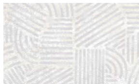
8739-19 Zen Raking Pattern Mist