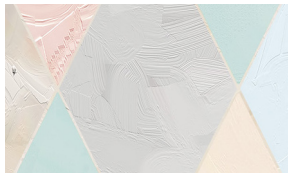
8662-12 Harlequin Champagne

All fabric quantities are based on 15yd bolts unless otherwise indicated.