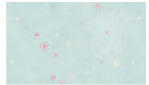
8668-78* Asterisk Mint