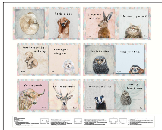
8671BP-19 Soft Book Panel Mist