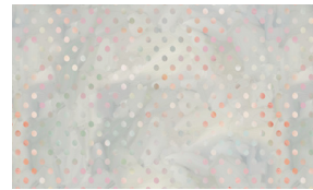
8666-92 Shaded Dot Pigeon