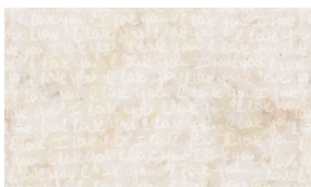
8670-41 Whisper I Love You Parchment