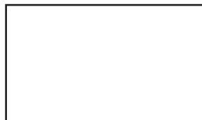
White Sugar-9 Peppered Cottons White Sugar