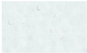
8664-17 Pale Moon Ice