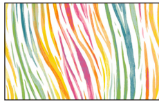
7317-246 Rainbow Zebra - Multi