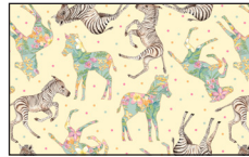
7323-44 Floral Zebras - Yellow