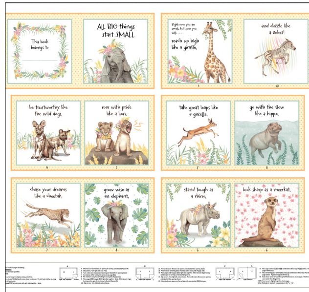
7325P-44 Baby Animals Book Panel Multi