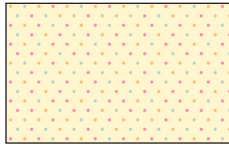
7321-44 Multi Dot Yellow