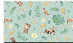
7324-66 Tossed Carnivores - Sage