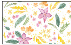
7318-246 Floral Pieces - Multi