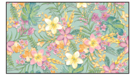
7320-66 Floral Bouquets - Sage