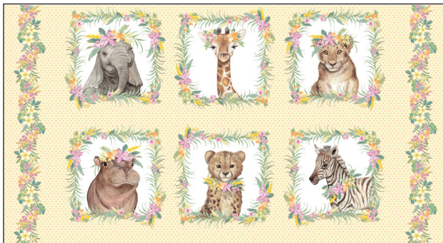
7315-44 Baby Animals Block Print Multi