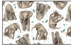
7322-09 Elephants White/Gray