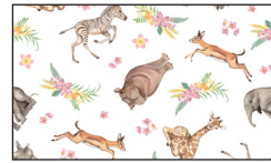
7319-13 Tossed Herbivores - Multi