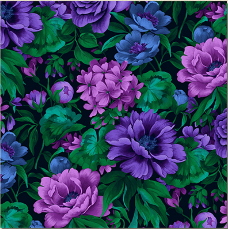
Large Floral 7640-56 Backing Fabric Option