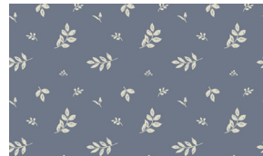
7596-77 Sprigs Navy