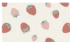
7594-22 Strawberries Dark Pink