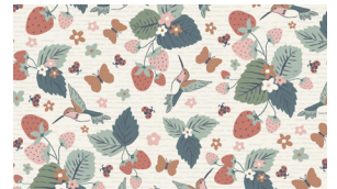
7598-26 Humming Berries Cream/Multi