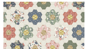
7604-427 Grandma's Garden Cheater Cream/Multi