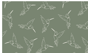
7595-66 Hummingbirds Sage