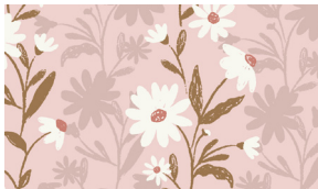
7592-22 Daisies Pink