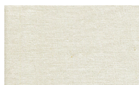
Peppered Cottons Oyster-35