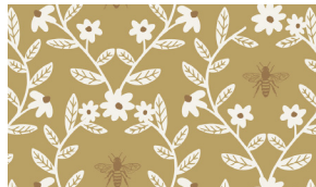
7593-44 Bees Dark Gold