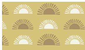
7601-44 Suns Gold