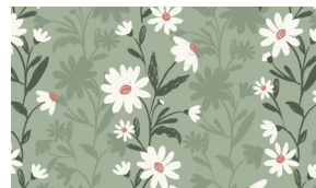
7592-66 Daisies Sage