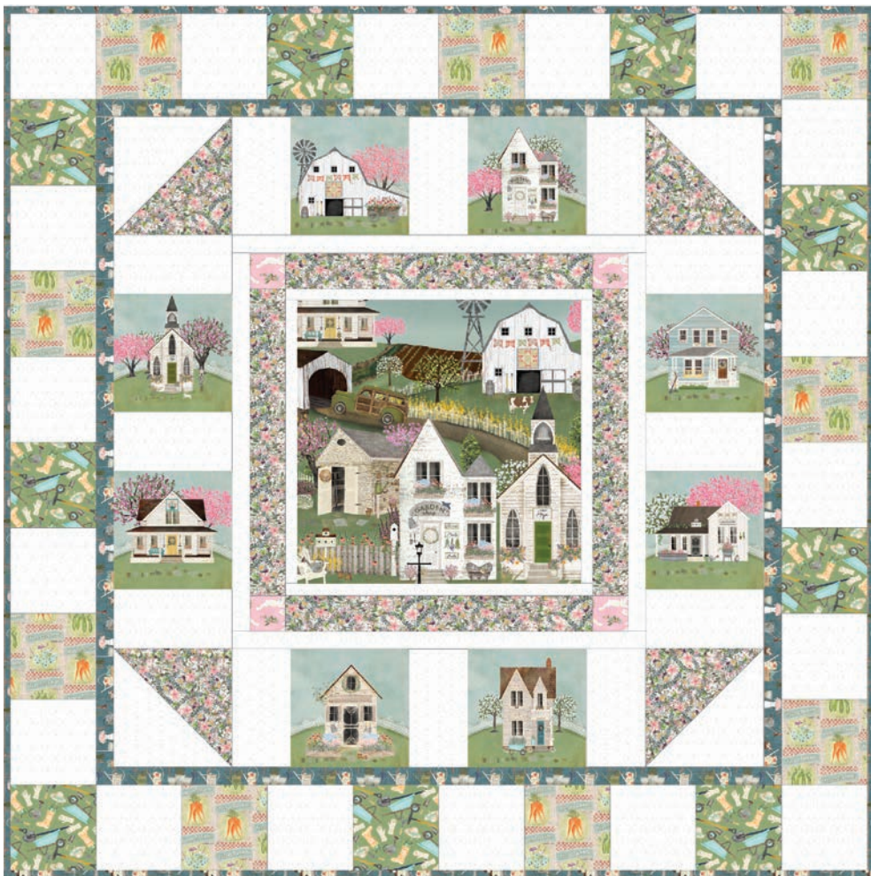
Finished Town Quilt Size: 73" x 73"