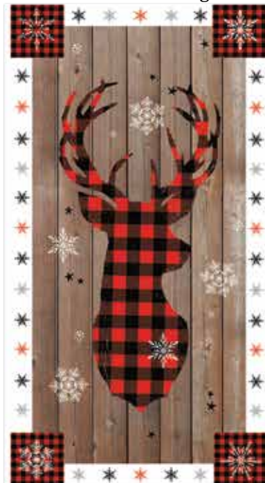
24 inch Deer Centered on Wood Grain Multi - 5879P-89