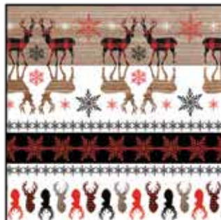
Novelty Stripe Rustic Motifs Multi - 5878-89