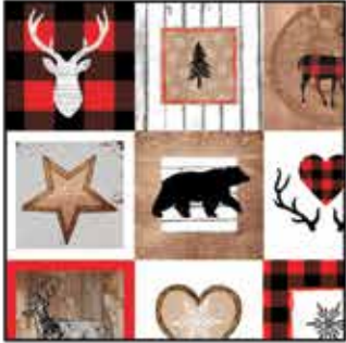
6 inch Blocks of Rustic Winter Motifs - Multi - 5868-89