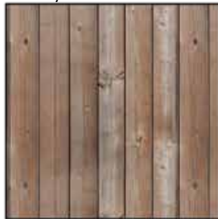
Wood Grain Brown - 5877-33