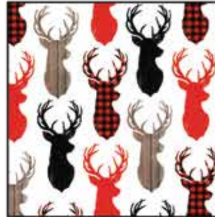
Deer Head Allover Multi - 5874-89