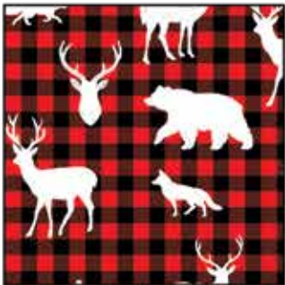
Buffalo Check with White Animals - Red/Black - 5876-89