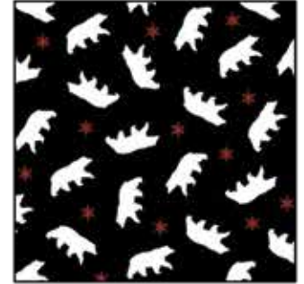
Tiny Tossed Bears Black- 5871-99