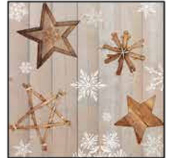
Wood Grain with Snowflakes & Stars - Light Brown - 5875-33