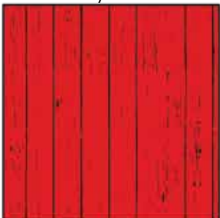
Wood Grain Red - 5877-88