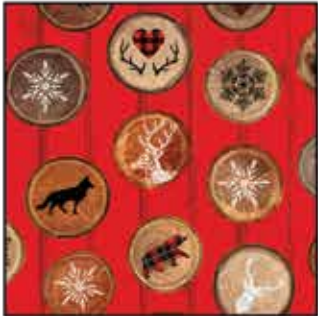
Tossed Circles with Rustic Motifs - Red - 5872-88