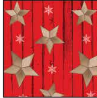
Wood Grain with Tossed Stars Red - 5870-88