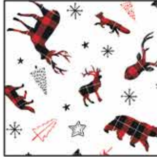
Tossed Plaid Animals White/Red - 5869-8