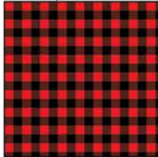
Buffalo Check Red/Black - 5873-89